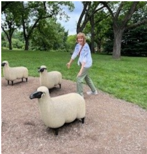
just a typical day for the pastor herding the sheep