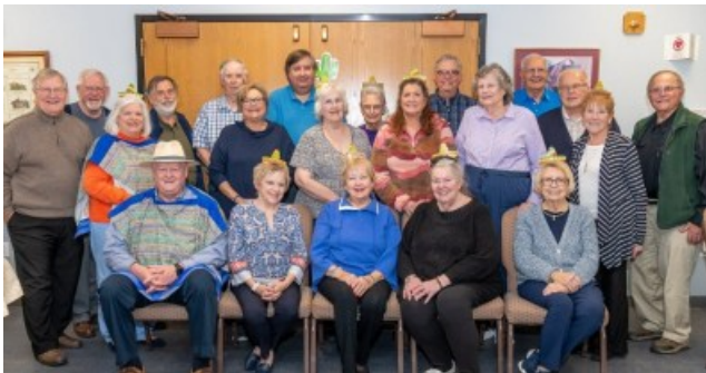
Cinco de Mayo Fun! Aldersgate Fellowship Group